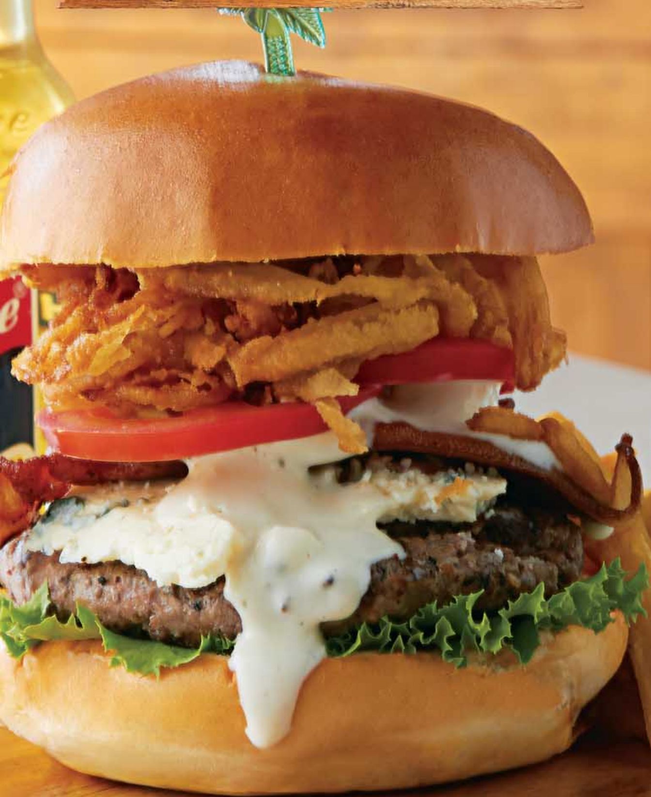
B.O.B. (Bacon, Onion, Bleu Cheese) Burger