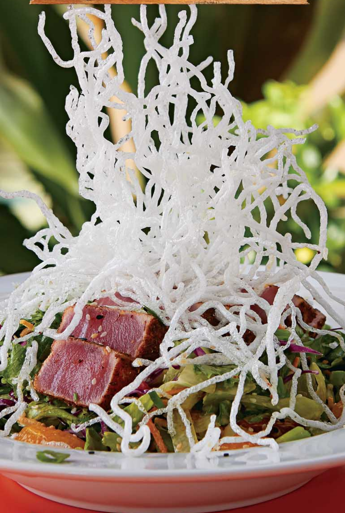
Blackened Ahi Tuna Salad