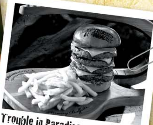
Trouble in Paradise

Take our Trouble in Paradise challenge. IF you finish our spectacular quadruple patty version of our Cheeseburger in Paradise, fries, pickle, and all... in less than 12 minutes... WE'LL pay for it! $24.95