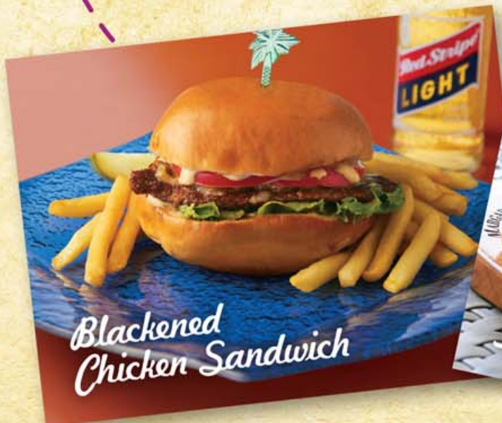
Blackened Chicken Sandwich

All sandwiches and burgers come with French fries. Add onion rings to any item for 3.00.