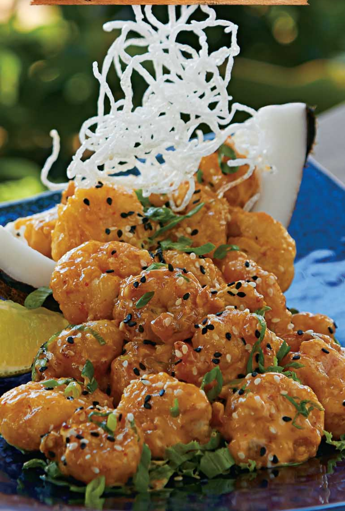
Lava Lava Shrimp