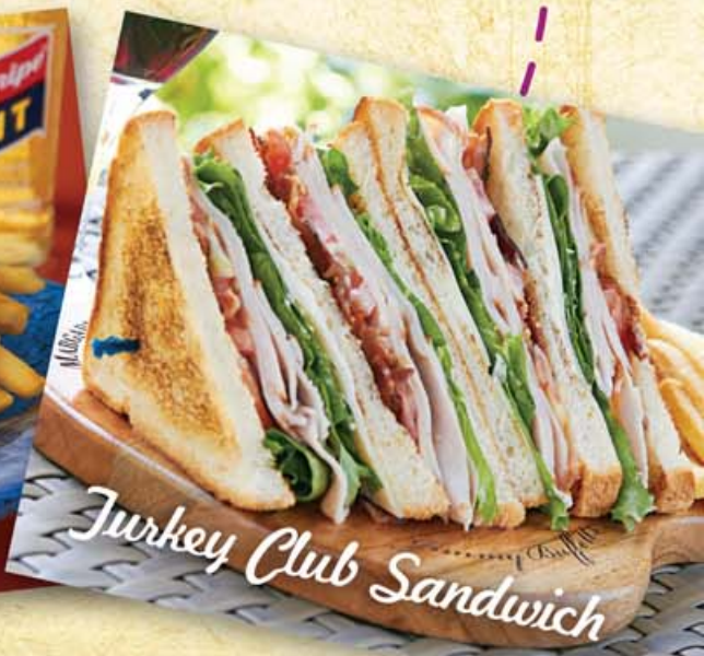
Turkey Club Sandwich