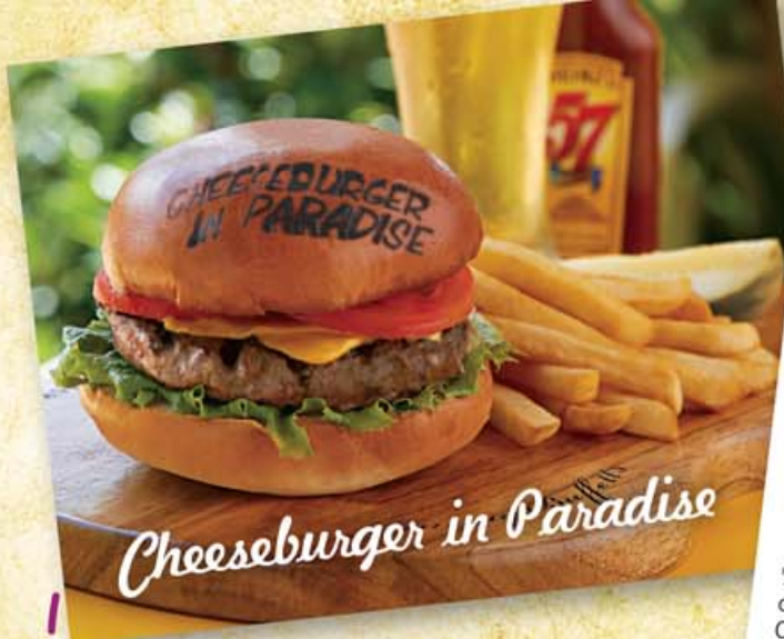
Cheeseburger in Paradise