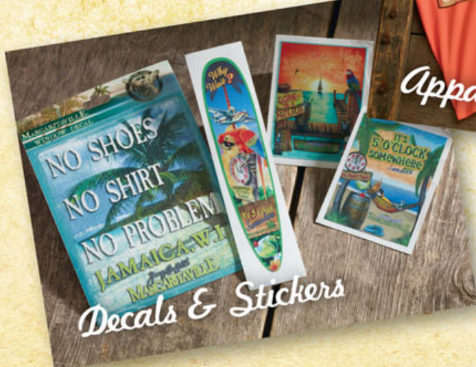
Decals & Stickers